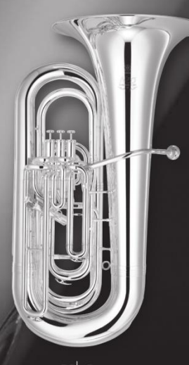
BB<sup>b</sup> Bass YBB632S NEO