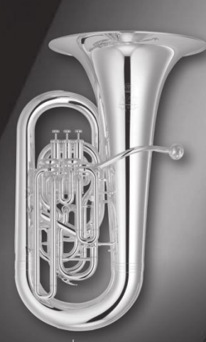
EE<sup>™</sup> Bass YEB632S NEO